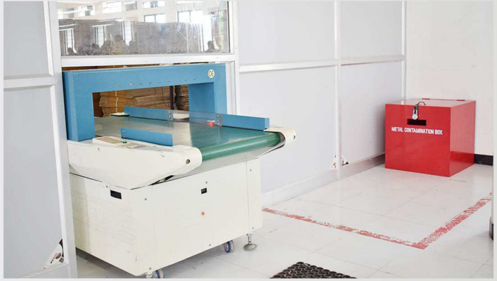
METAL FREE ZONE