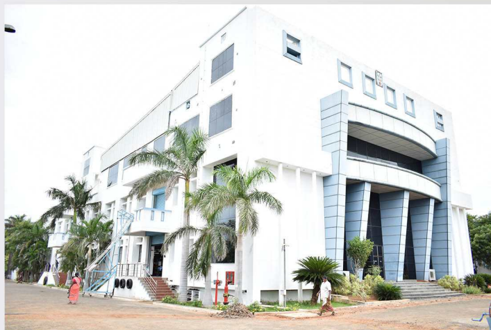
OFFICE & FACTORY