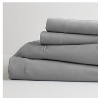
The Big One® Extra Soft Sheet Set with ★★★★☆ (10781)

Here are some other great items you might like: