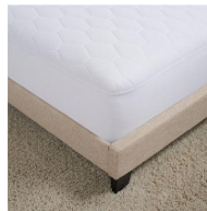
The Big One® Waterproof Mattress ★★★★★ (6734)