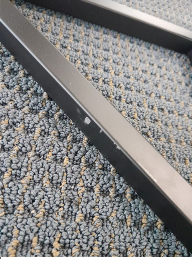
271738-001 - DAMAGE IMAGE