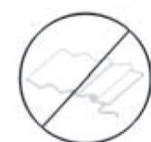
DO NOT FOLD OVER

CAUTION: Not having the warming blanket laying FLAT and UNCOVERED increases the risks of overheating and possible fires.