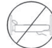
DO NOT TUCK

CAUTION: DO NOT COVER with Heavy Quilts, Comforters, or any DOWN Filled item.