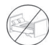
DO NOT COVER