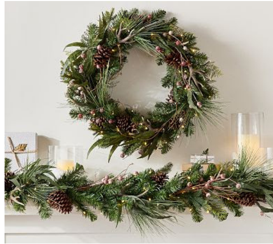
Pre-Lit Faux Tahoe Pine Wreath & Garland