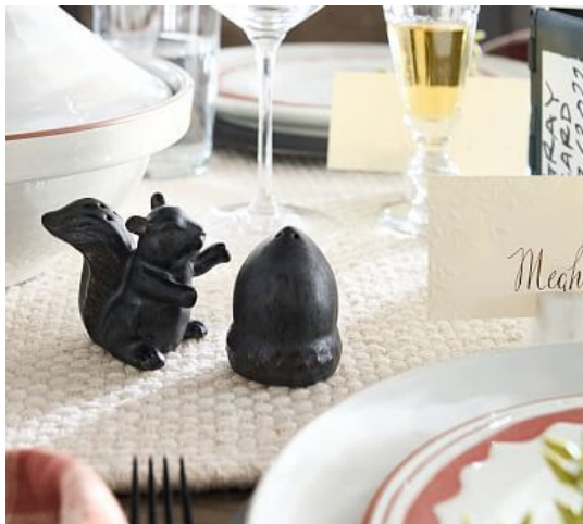
Bronze Squirrel Stoneware Salt & Pepper Shakers

These items complement your current order: