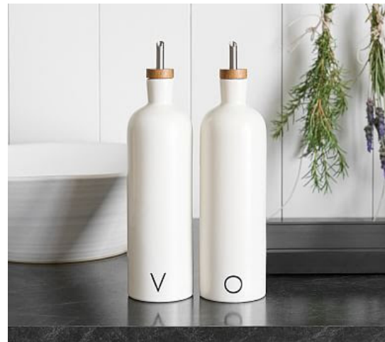
Mason Stoneware Oil & Vinegar Cruet