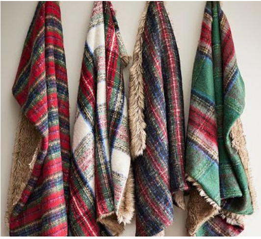
Stewart Plaid Fur Back Throw