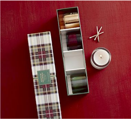
Holiday Discovery Scented Votive Candle Gift Set