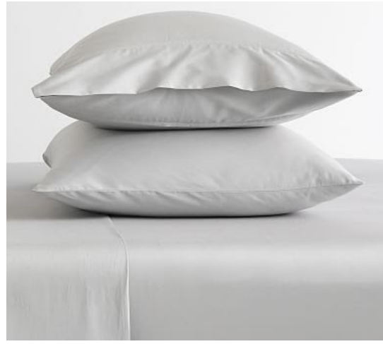
Essential Sateen Pillowcases - Set of 2