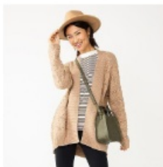
Women's Sonoma Goods For Life® Plush ★★★★☆ (113)