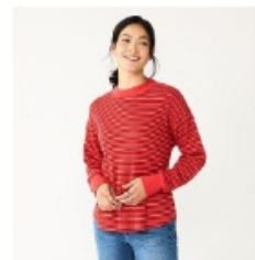
Women's Sonoma Goods For Life® ★★★★☆ (98)