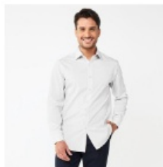
Men's Apt. 9® Premier Flex Slim-Fit ★★★★☆ (659)