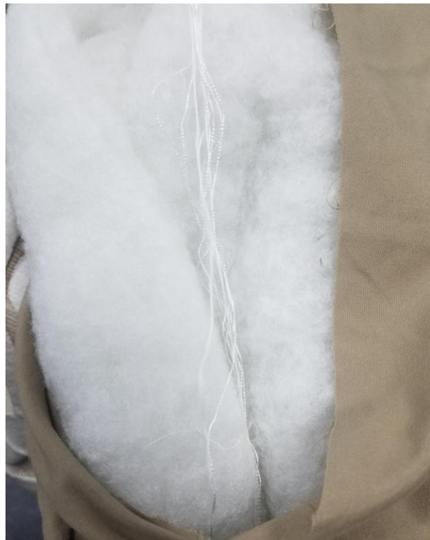
The JLA MP Odette Comforter sample submitted for testing demonstrates poor durability with the white jacquard yarns of the back side of the face fabric unraveling at the raw edge and becoming entangled in the batting