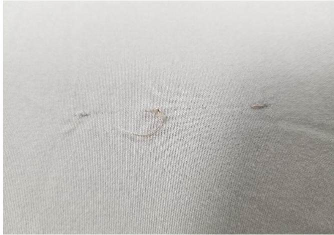
The sample demonstrates poor durability in laundering with holes noted around the Bar tacks on the back of the comforter