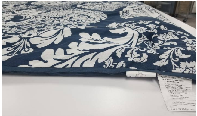
The batting used in the sample demonstrates poor durability in laundering with considerable batting migration