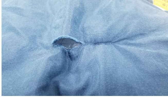
The sample demonstrates poor durability in laundering with holes noted around the Bar tacks on the back of the comforter