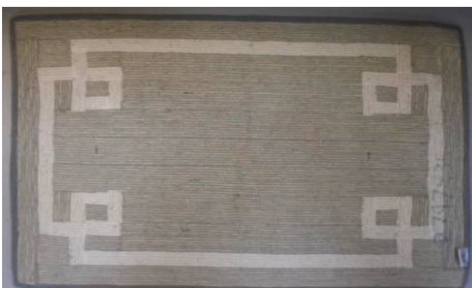
After 5 Wash Cycles